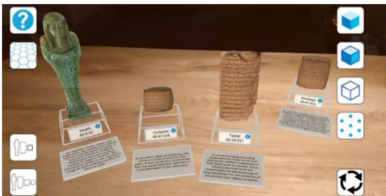
Figure 4. The AR Museum app

Figure 3 (middle) summarises the connected virtual experiences prototyped by the VCTR AR Museum apps (Woolley et al., 2020). As shown in the Android AR app screenshot in Figure 4, the app demonstrates the enablement of museum visitors (virtual and physical) to acquire, curate, exhibit, share and interact with eclectic 'takeaway' 3D artefact models.