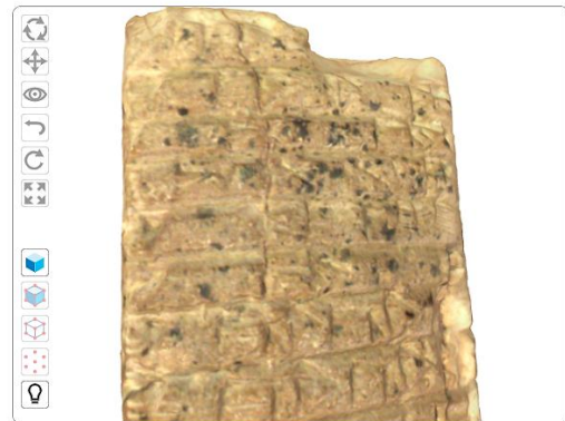
Figure 2: A 3D cuneiform tablet interaction. The writing tells us that the King is going to Sumer. His large party need lentils, milk, cumin, figs, beer and more (Cripps 2010; 2021).

Palm-sized Mesopotamian clay tablets inscribed with cuneiform script are the earliest human writings. Whilst not visually striking these clay records provide fascinating insights into humankind’s first civilizations. Figure 2 shows a 4,000-year-old cuneiform tablet in the 3D viewer interface of The Virtual Cuneiform Tablet Reconstruction Project (VCTR): virtualcuneiform.org (Woolley et al., 2017). The viewer enables all around interactive views of tablets (Collins et al. 2017; 2019) and provides a digital opportunity to connect information, context and experiences to artefacts that have limited visibility and availability to museum visitors.